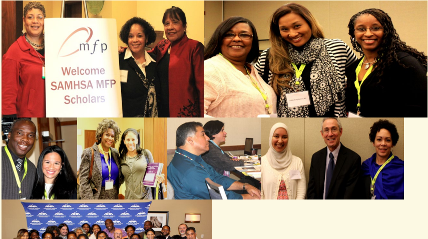
Photo Highlights: 2014 American Nurses Association and American Psychiatric Association Minority Fellowship Program Trans-Disciplinary Intensive Winter Institute. Click here to watch video highlights.