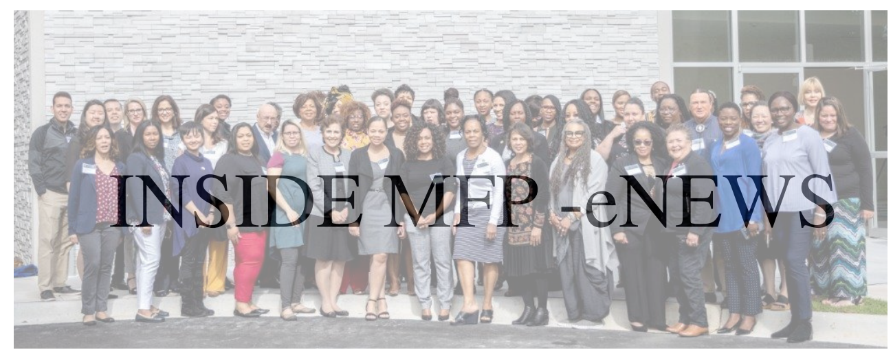
MAY 23, 2019 ISSUE 2